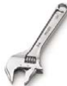
Plumber's Wide-Mouth Adjustable Wrench