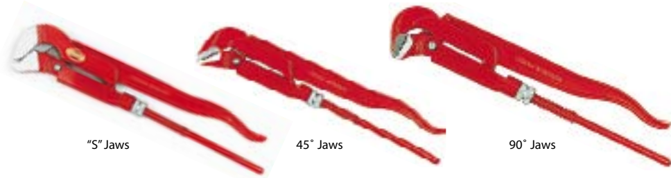
"S" Jaws Model