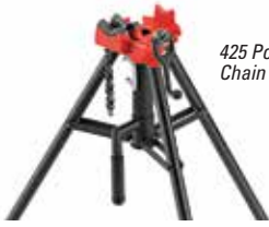
425 Portable TRISTAND Chain Vise