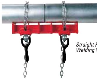
Straight Pipe Welding Vise