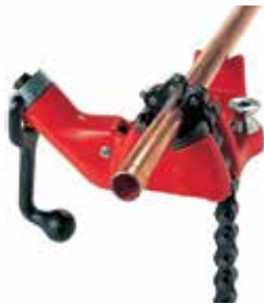
Top Screw Bench Chain Vise