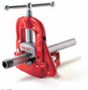
Bench Yoke Vise