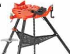
460-12 Portable TRISTAND Chain Vise