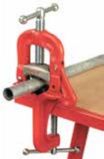
Portable Yoke Vise