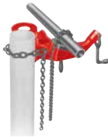
Top Screw Post Chain Vise