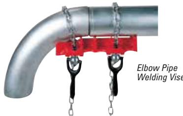
Elbow Pipe Welding Vise