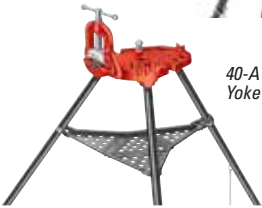
40-A Portable TRISTAND Yoke Vise