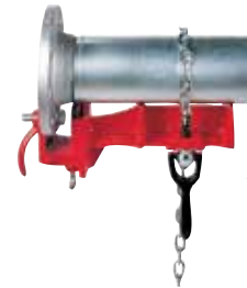
Flange Pipe Welding Vise