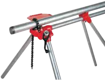
Top Screw Stand Chain Vise

** For model 460-6, jaw for plastic pipe, Catalog No. 41280 available; order separately.