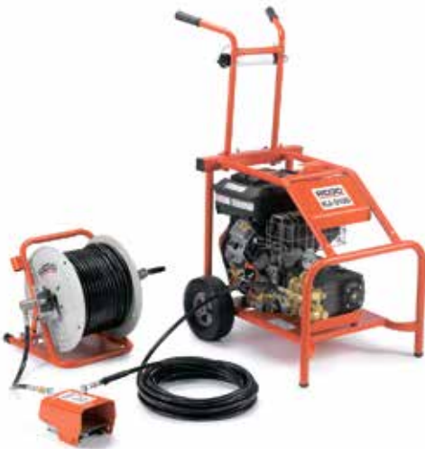
Model KJ-3100 with hose reel removed