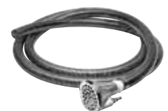
Jet Vac Unit

The Jet Vac attaches to any portable water jetter to quickly remove (vacuum) liquid and debris from flooded basements, sumps, swimming pools, construction sites, car wash pits, etc. This cost and time saving product will move up to 60 gallons of liquid per minute.