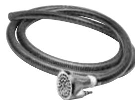
Jet Vac Unit